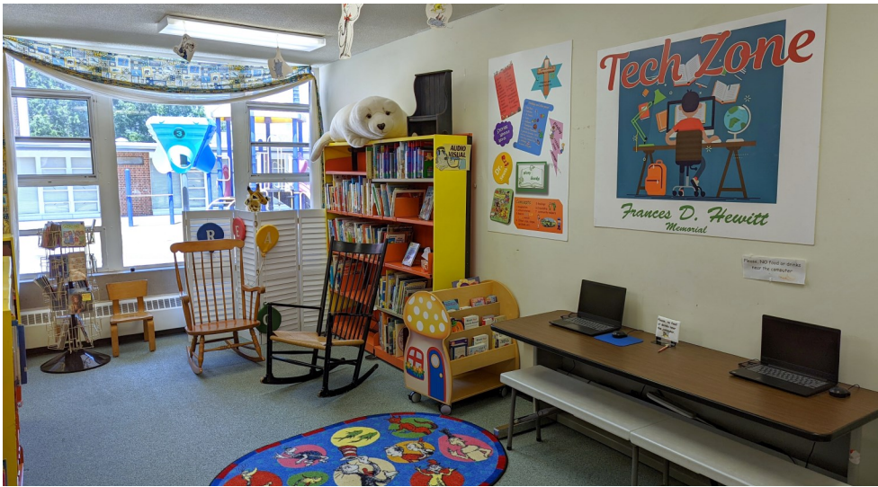
FBC's Kesler Children's Library makeover, complete with new laptops!

there is a barn-like stand full of books at all times and a garden bench for sitting and reading. This relatively quiet spot gets a lot of attention.