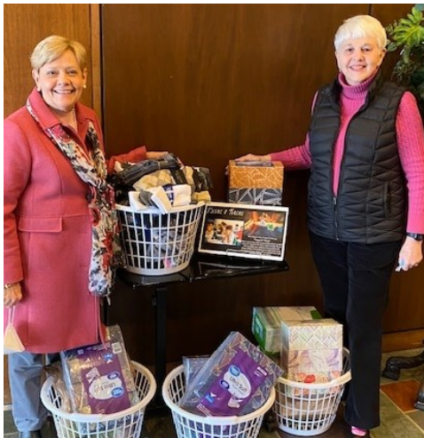
"Noses & Toeses" Collection and Delivery

Each month, the women of our church in the WMU meet together to learn about missions engagement and to sponsor mission action projects to keep our church focused on outreach.