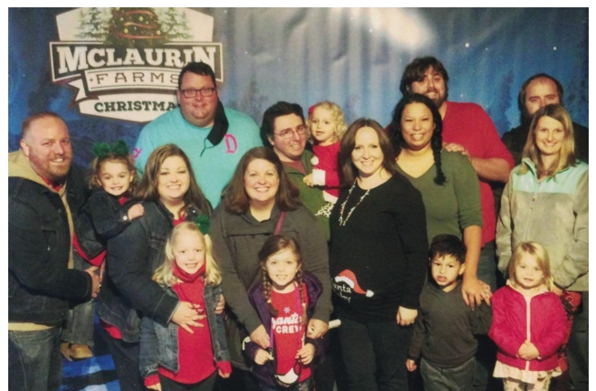
Journey/Families Outing to McLaurin Farms at Christmas