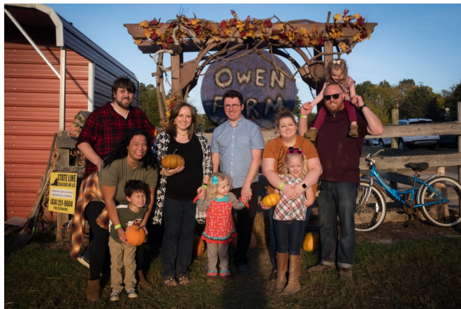
Journey/Families Outing to Owen Farm in the Fall

Now, meeting in Room 110 each Sunday morning (with a Zoom option to join virtually as well), the group continues to learn and grow together in faith and fellowship.