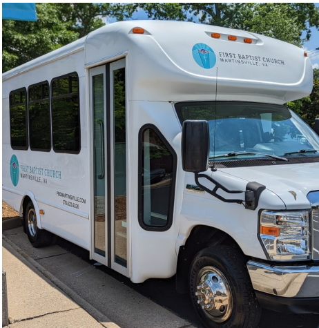
MHC Warming Center—we collected donations and provided our bus and drivers for this ministry.

In the winter, WMU hosted a churchwide collection of donations for the Warming Center, and church members volunteered their time driving our bus and providing food and other services.